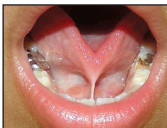
557 Lingual Frenum